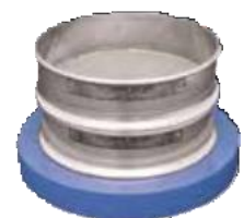
SSA-811 shown with Sieves