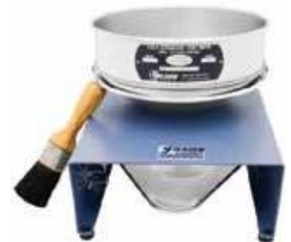
SSA-802 shown with Sieve