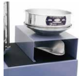
SSA-801 shown with Sieves on SS-8R