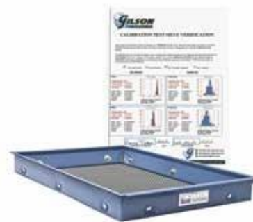
GV-66 Calibration Verification shown with Screen Tray