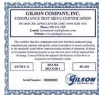
Certificate of E 11 Compliance for all Sieves