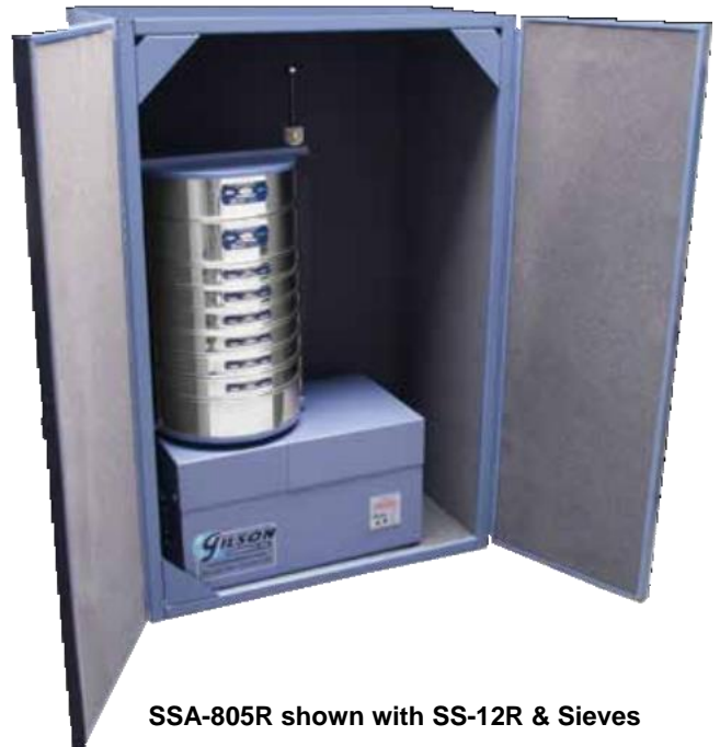
SSA-805R shown with SS-12R & Sieves