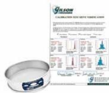
GV-65 Calibration Verification shown with Sieve

All Gilson test sieves meet ASTM or ISO requirements for Compliance Test Sieves. Ordering additional verification services for each individual sieve upgrades them to meet Inspection or Calibration specifications.