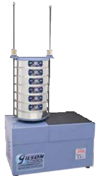
SS-8R Gilson Tapping Sieve Shaker shown with Sieves