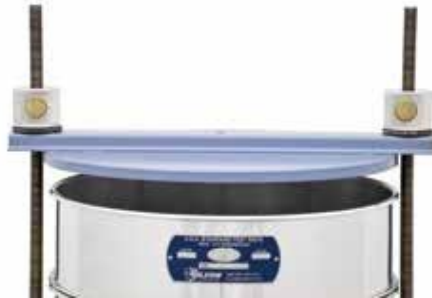
SSA-809 shown on SS-12R with Sieves