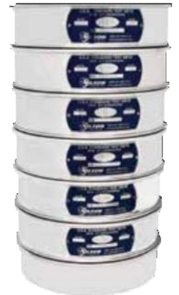
8in Round Test Sieves