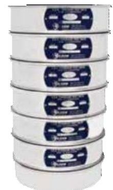
8in Stainless Steel Test Sieves