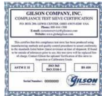
Certificate of E 11 Compliance for all Sieves