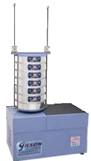
SS-8R Gilson Tapping Sieve Shaker shown with Sieves