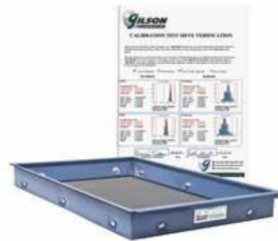
GV-66 Calibration Verification shown with Screen Tray