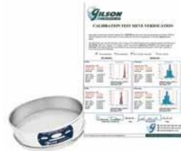
GV-65 Calibration Verification shown with Sieve

All Gilson test sieves meet ASTM or ISO requirements for Compliance Test Sieves. Ordering additional verification services for each individual sieve upgrades them to meet Inspection or Calibration specifications.